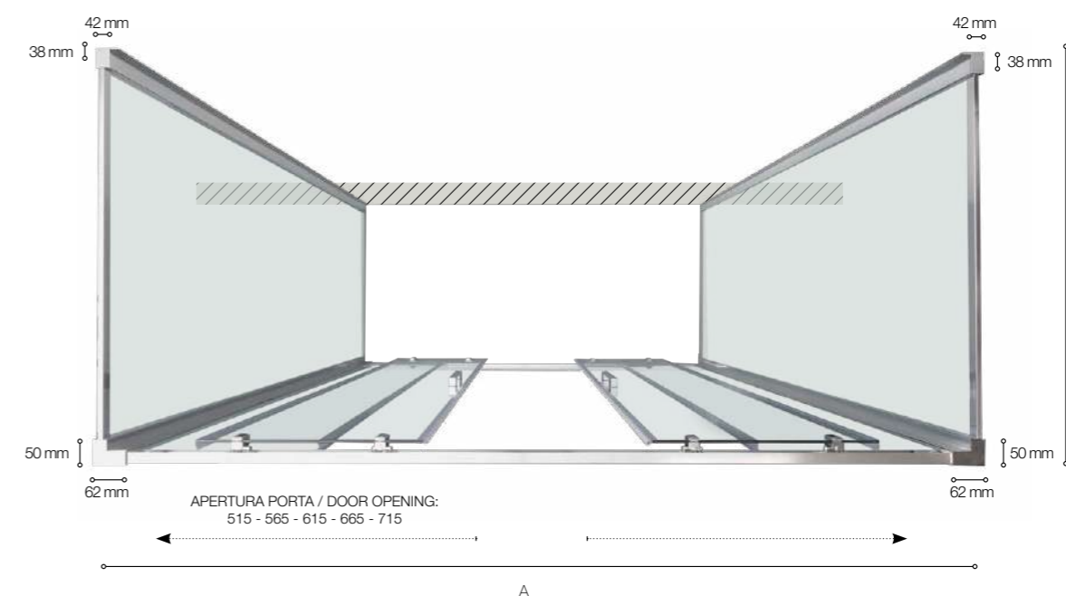
Versione Centro Parete Center Wall Version